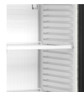
LED light inside door frame