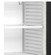
LED light inside door frame