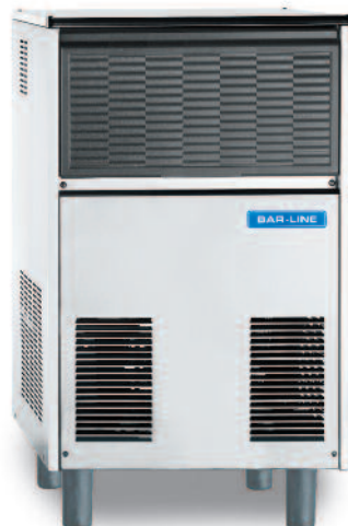
BF 80 AS/WS

Bar-Line Equipment range is the well-known EU-made line of ice machines used and appreciated by many for its reliability. Built in the Italian manufacturing plant of Frimont Spa, ISO 9001 Certified, these units are built with sturdy, corrosion resistant stainless steel, and feature European-made components to assure maximum ice-quality and machine longevity. Quality tested one-by-one, the Bar-Line self-contained units feature a well balanced ratio between production and storage capacity, alongside with reduced outer dimensions that allow for built-in installations. Contemporary, elegant design unites excellent operational features with the reliability obtained through years of successful experience in ice making technology.