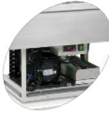
Automatic evaporation defrost water