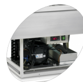
Automatic evaporation defrost water