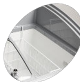
White coated inner liner