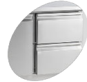
Drawers as option