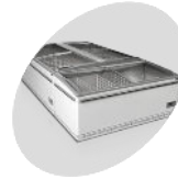
Island installation, bumper bars as option