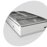
Island installation, bumper bars as option