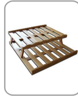
Presentation shelf available