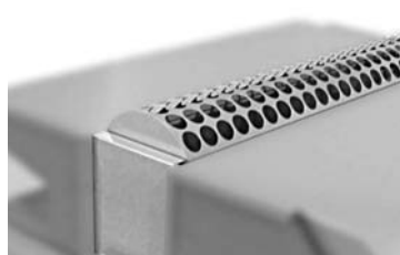
Back-to-back mounting kit