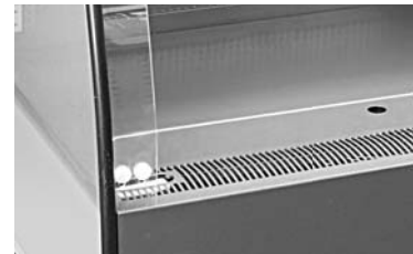
Energy saving trim kit