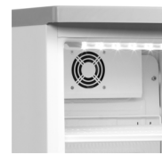
Fan assisted cooling