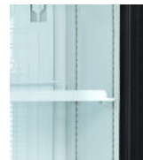
LED light inside door frame