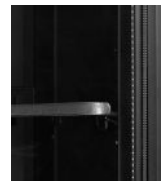
LED light inside door frame