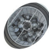
Internal fan and basket