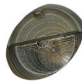
Internal fan and basket