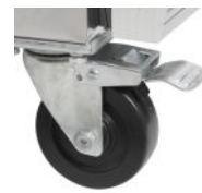
Strong castors as option