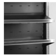
Adjustable shelves with tilting function