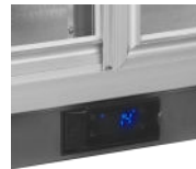
Protective thermostat cover