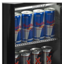
Designed for Energy-cans