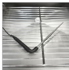
Core sensor included