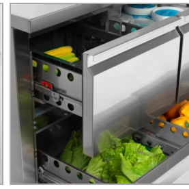
Drawers available as seperate kit