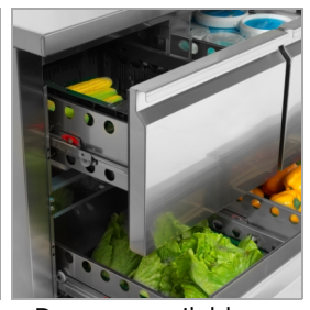
Drawers available as seperate kit